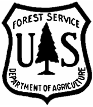
Exhibit "A" Area Closure Order No. 06-05-586 Klamath National Forest